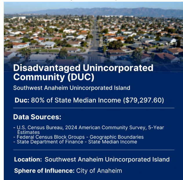
Figure 2: DUC Profile