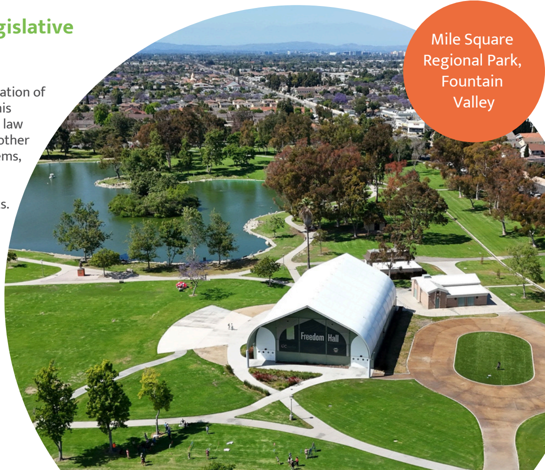
Mile Square Regional Park, Fountain Valley

Finally, the OC LAFCO team looks forward to visiting with the staff of cities, special districts and the County at the various agency hosted regular and quarterly meeting and other opportunities.