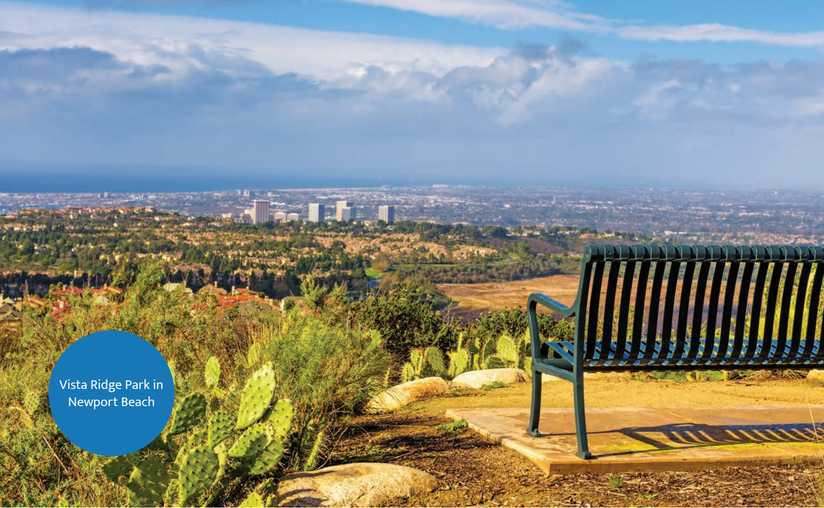
Vista Ridge Park in Newport Beach