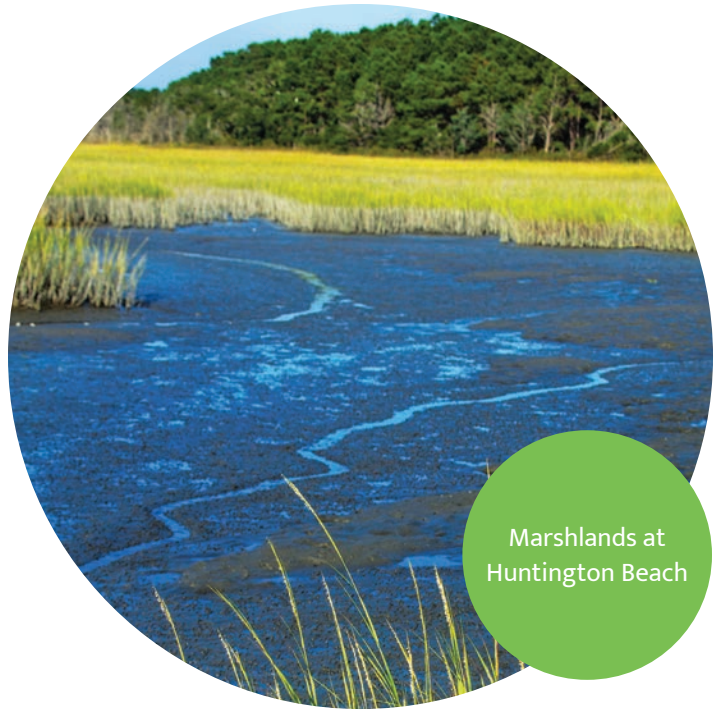
Marshlands at Huntington Beach

Over the past two years, the Commission has seen an uptick in applications from landowners seeking to improve the boundary for their property. One application filed with OC LAFCO during the current fiscal year includes a landowner petition to realign a property that is currently split between the County of Orange and City of Tustin.