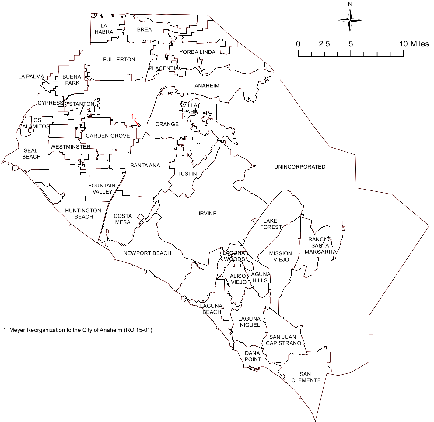
1. Meyer Reorganization to the City of Anaheim (RO 15-01)

January 1, 2017 Jurisdictions January 1, 2016 Jurisdictions