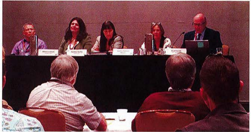
A session on "Preparing Complex MSRs"

The CALAFCO Annual Conference was held in Sacramento on October 30 through November 1, 2019. The OC LAFCO staff participated in the planning process for the conference and served as coordinators and panelists for several sessions. The conference featured sessions on LAFCO's role involving facilitating responses to local catastrophes and issues related to the lack of housing, and the independence of LAFCO.