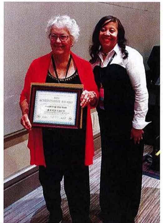
OC LAFCO receives CALAFCO "Project of the Year"

Each year, during the annual conference, CALAFCO recognizes outstanding achievements by LAFCOs and individuals throughout the state. This year, OC LAFCO was awarded the Project of the Year which recognizes an organization for a project-specific program that involved complex analysis, community involvement, and an outstanding solution. The award recognized the leadership and effort of the Commission and staff for the City of San Juan Capistrano Water and Wastewater Utilities Municipal Service Review. In announcing the award, CALAFCO noted that this MSR resulted in a solution that ultimately will improve the efficient delivery of water and wastewater, two vital and highly regulated municipal services, to the City's communities. The award presenter also emphasized that the outcome of this project serves as a model of the importance of MSRs, which is a key mandate for all LAFCOs.