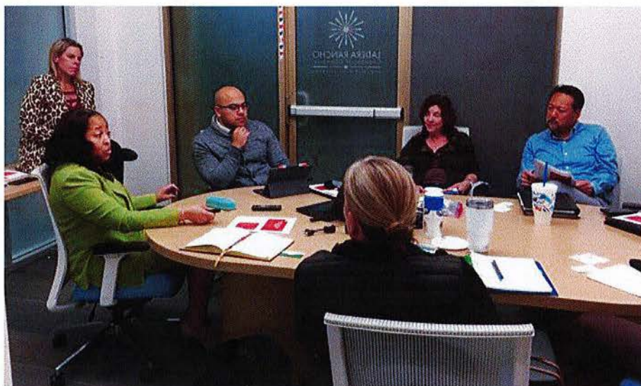
A visit with the Ladera Ranch Civic Council

Relatedly, staff continued to conduct quarterly meetings with the representatives of Rancho Mission Viejo to discuss the timeline for the development of its properties.