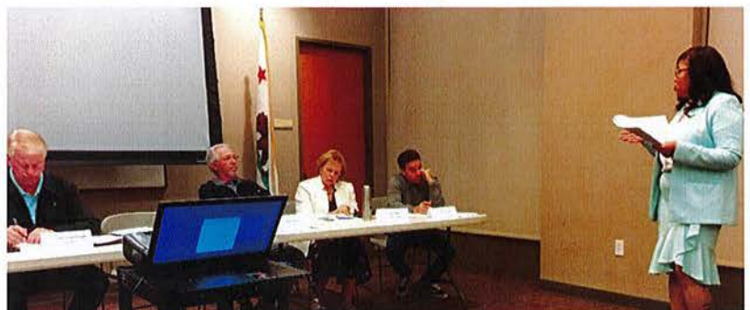
Presentation to the Cota de Caza Planning Advisory Committee

One of the strategic areas identified by the Commission for the FY 2019-20 Work Plan was to engage the South Orange County Unincorporated Communities (SOCUC) to assist with identifying a pathway to future governance. During this quarter, OC LAFCO staff began meeting with the communities to encourage participation in this effort and to receive preliminary feedback on